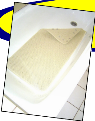
Bath Mat - Deluxe