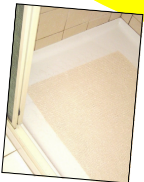
Safety Matting/ Footgrip