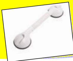
Removable Hand Rail— Extendable