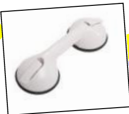
Removable Hand Rail

especially in shower/bathroom areas. Water drains through easily. Gives a cushion effect. Easily washed with detergent. Wet or dry surface matting.